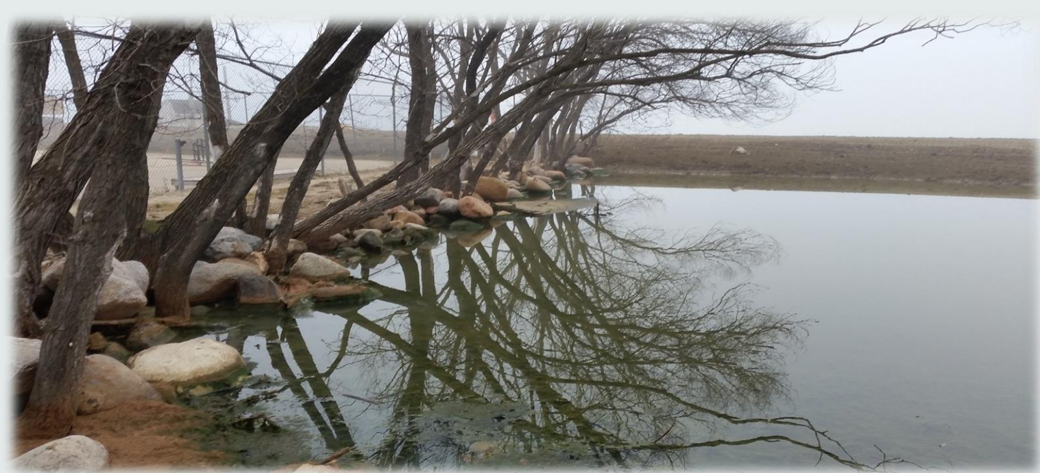
Before construction and during construction.

A new beach area is worked into the engineering plans. This non-essential element was a gracious and welcome gift from the Water Security Agency and will certainly assist in reviving tourism in 2017.