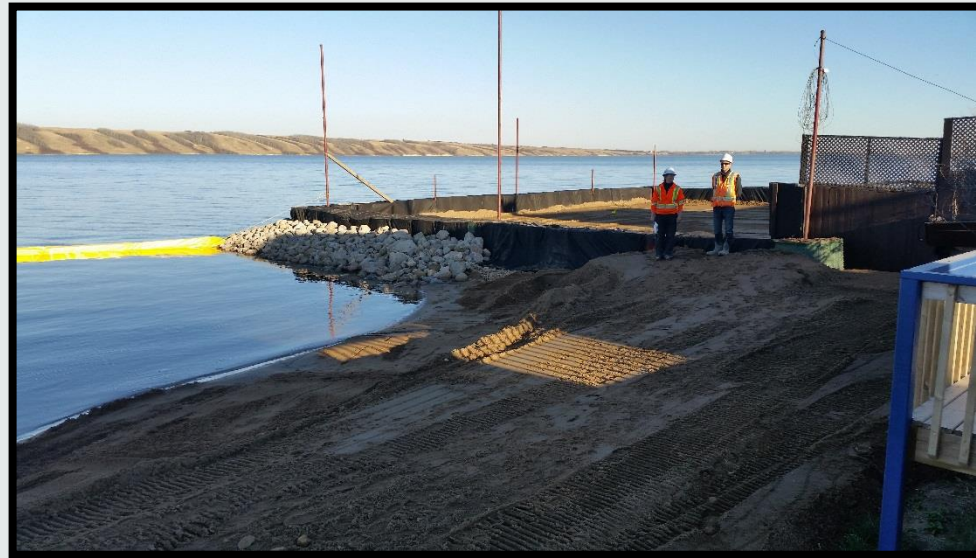
Mike's Beach Bar & The Village Perk