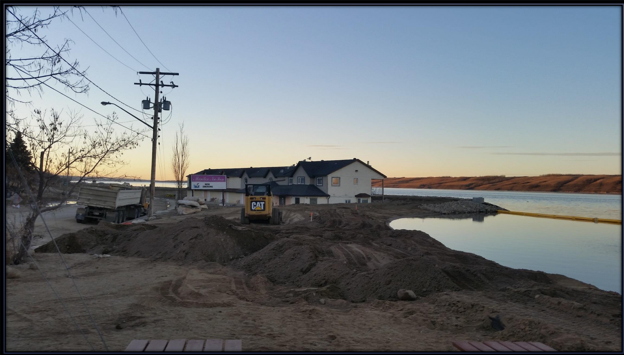
Main Beach and Business Area